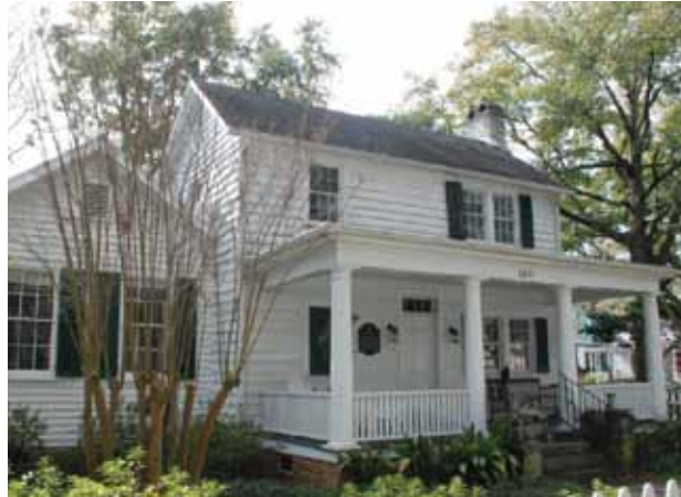
602 Chestnut Street is protected by an easement